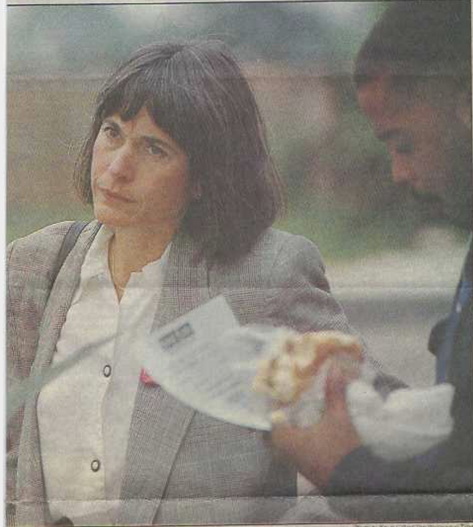
Teamsters represent many corrections workers. She seeks an at-large vice presidency in the union.